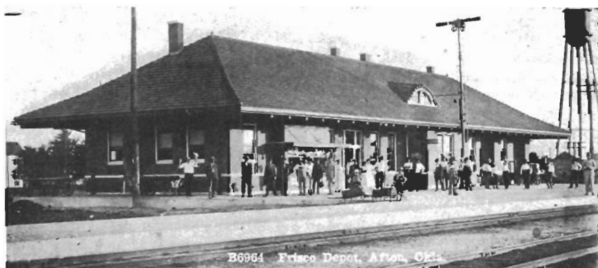
New Passenger Depot, Afton, Okla.