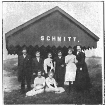
A happy bunch at Schmitt, Mo.